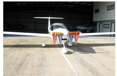
1999 Diamond Motor-glider: Rare & Pristine. 190 TTAE