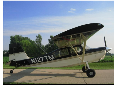
2001 American Champion Scout: Loaded!

Have leaseback opening for G1000-equipped Cessna 172S. Deduct total cost of plane in 2011. Monthly income!