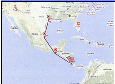
BEACON LIGHT ON—COSTA RICA

Innovative Aviation Leadership since 1962