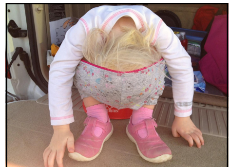
WE FIND SOLUTIONS!!!