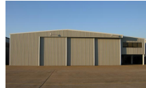
Hangar B3 281-492-2130