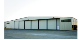
Hangar G4/5 281-492-2130