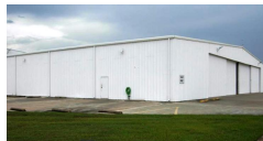
Hangar C2 281-492-2130