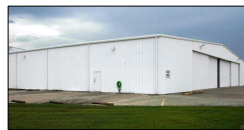
Hangar C2 281-492-2130