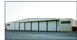
Hangar G4/5 281-492-2130