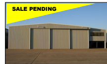
Hangar B3 281-492-2130