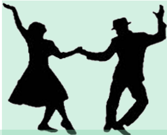
Commemorative Air Force SWING DANCE