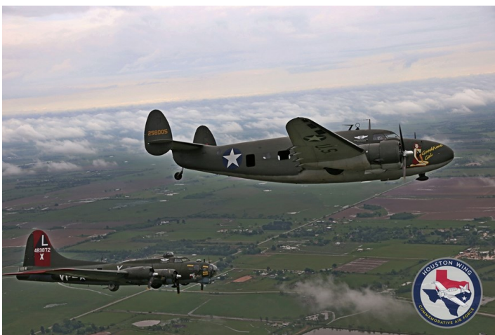
Houston Wing's Lockheed C60 and the Gulf Coast Wing's B-17, Texas Raiders on the way to Open House.

If the 100LL is contaminated with auto gas the color changes to clear. If contaminated with jet fuel it will smell like kerosene. Some other liquids may cause your drainage sample to smell like a paint thinner. The presence of Jet A will cause the fuel to be slightly oily. If you dip a finger in the sample and you blow on the wet finger the avgas will evaporate and leave your fingerprints with a chalky look. Jet A will leave them wet looking. Continued Page 3.