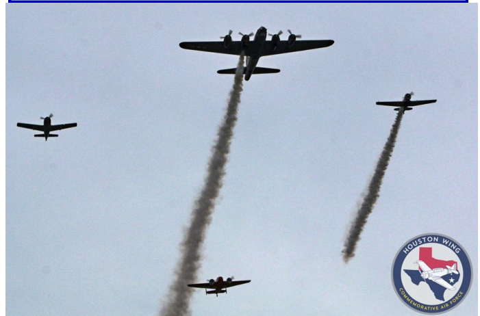
Texas Raiders along with little friends, AT-6, T-28 and C45 on departure from IWS

Beech Bonanza and Baron Dual Yokes FOR RENT 281-492-2130