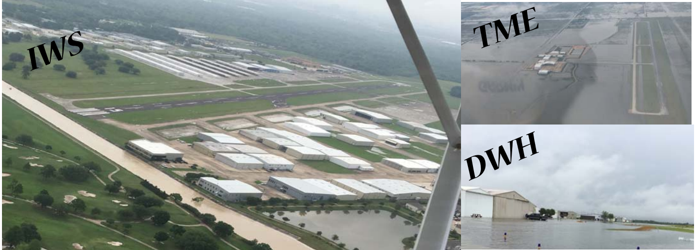
Above picture West Houston Airport Top right Houston Executive bottom Right Hooks Airport Tuesday, April 19, 2016 approx. 11:15 am