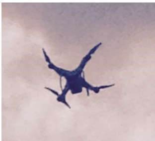
Drone flying over departure end of 33 at IWS and the Pine Forrest Country Club