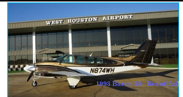
1993 Baron 58- Beautiful!