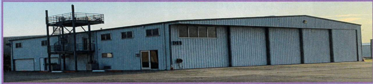
5,000 sq ft — Beautiful apartment with income stream from hangar rentals

D11 For Sale or Lease Hangar / Home / Office Call Woody at 281-492-2130