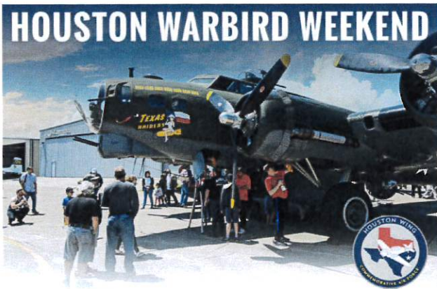
Commemorative Airforce WARBIRD WEEKEND!!