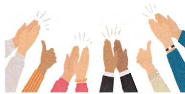
First Solo Flight!!!