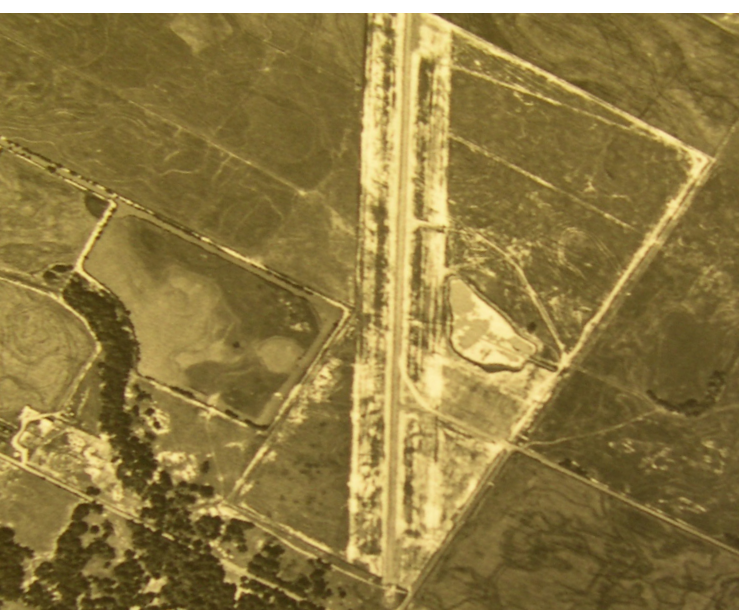
The Airport in 1962

No Jeff, we don't need to privatize ATC. We just need to keep a good thing going as it is. In other words, "if it ain't broke, don't fix it!"