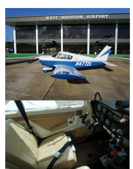
1967 Piper Cherokee 180 TTAF: 3.600 Hrs. SMOH: 1600, O STOH 180 HP Lycoming Engine Garmin 345 Audio Panel Garmin 530 GPS WAAS Garmin Transponder/Encoder King KX 155 NAV/COM/GS STEC 30 Autopilot with Altitude Hold