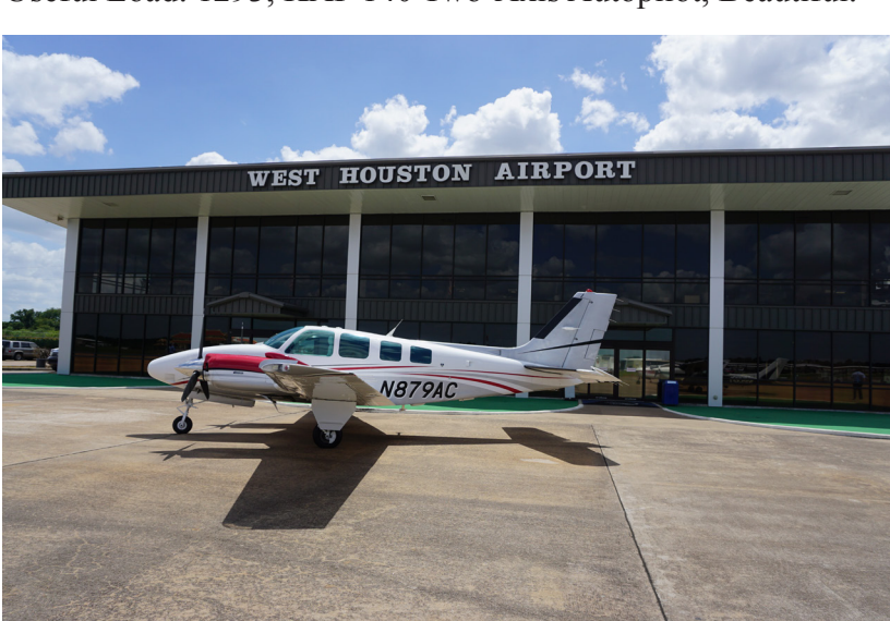
1996 Beechcraft 58 Baron S/N: TH-1777

4500 TTA, 25/25 SMOH Engines (Custom Aeromotive), 25/25 SOH Props, No Known Damage History, Recent Annual, PS Engineering PMA 450 Audio Panel with bluetooth, dual Garmin 530 WAAS GPS, 166 Gallon Fuel, Air Conditioned, Instantaneous Vertical Speed, King KT70 S Transponder Garmin GDL88 Traffic/Weather, King KFC150 Autopilot Flight Director, New Interior: Gray and Red, New Exterior: White & Red/ Black Stripe. COME TAKE A LOOK!