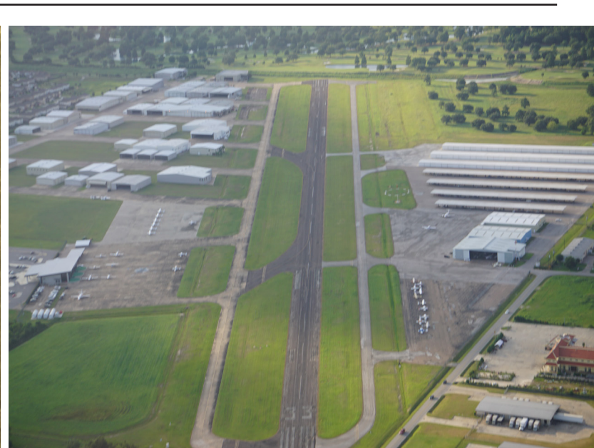
West Houston Airport 2015,