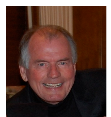
Contact: Woody Lesikar Or Youngest Daughter Stacy for detailed information. All aircraft located at West Houston Airport

Tel: (281) 492-2130 Fax: (281) 492-7028 P.O. Box 941789 Houston, Texas 77094-8789 18000 Groschke Rd. Houston, TX 77094 woody@westhoustonairport.com stacy@westhoustonairport.com