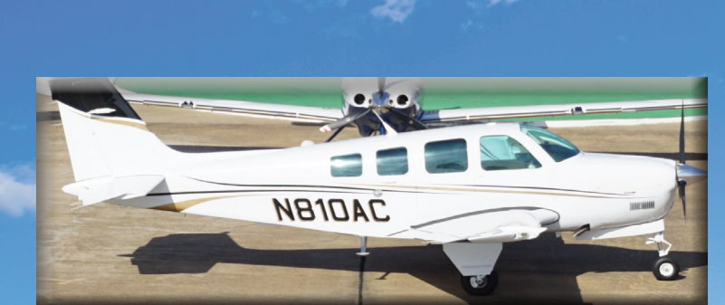
Beechcraft A36 Bonanza