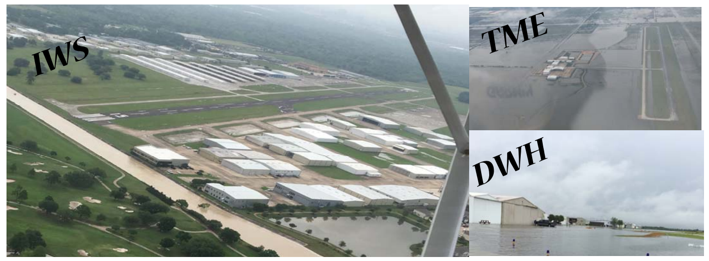
Above picture West Houston Airport Top right Houston Executive bottom Right Hooks Airport Tuesday, April 19, 2016 approx. 11:15 am