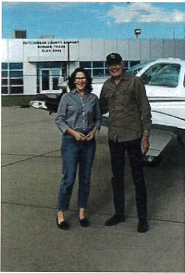
On Our Way to Montana!!