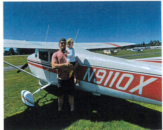
Pictured right another satisfied customer!!!