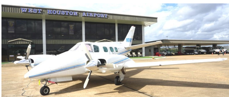
1979 Beech B60 Duke!