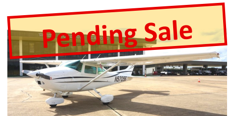
1979 Cessna 182Q — Very Nice!