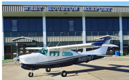
1979 Cessna T210 — Enroute!