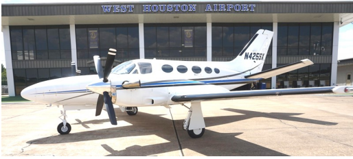
1982 Conquest I N425SX — Low Engine Hours, Great Plane!