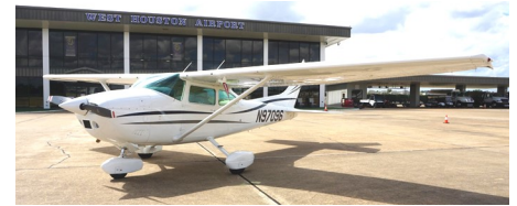
1979 Cessna 182Q — Very Nice!

C8, E1, G2, G15, G16 Financing Available