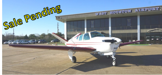
1955 F35 Bonanza! 6500 TTA, 600 SMOH, Upgraded!!