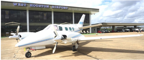
1979 Beech B60 Duke!