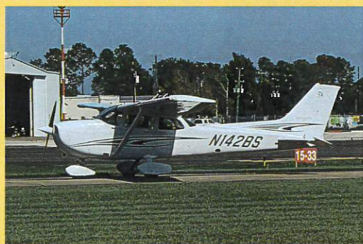
2005 Cessna 172 G1000, A/C