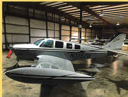
1995 A-36 Bonanza Loaded with Garmin and Tip Tanks.