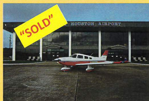
1999 Piper Archer III 100% Bonus Depreciation FOR SALE AND LEASEBACK!