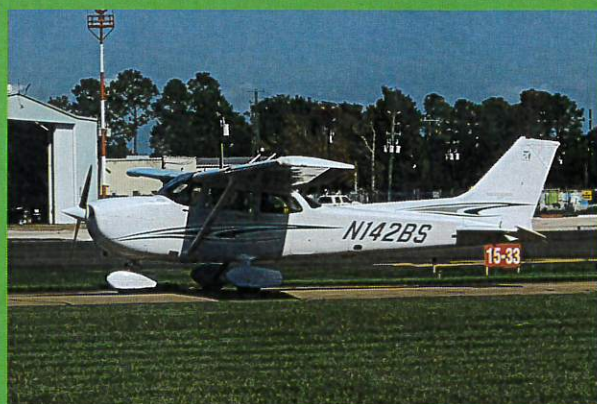
2005 Cessna 172