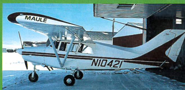
1997 Maule MXT7- 180A