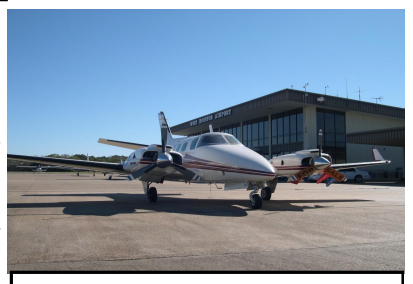
1977 Beech BE60 Duke: Garmin 750 GTN Touch screen. Financing available. Loaded!

Cirrus Partnership Opportunity: Three owners who have owned airplanes together since 2005 are looking to add a 2007 Cirrus SR22 G3, loaded with options, including A/C. For details call 713-515-7126