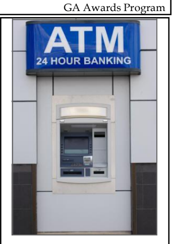
Need cash for your trip? ATM located in the terminal! Open 24/7/365 Member FDIC

a longtime friend and based customer, whose wife has cancer. Please call 281-492-2 1 3 0 o r e m a i 1 terri@westhoustonairport.co m to pledge your support. The Airport will have a Coach come one Saturday morning.