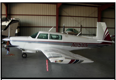
1981 Mooney M20K: Turbo, 3-Bladed Prop, Deiced, Garmin 430 GPS.

2009 Cessna Skyhawk 172S: 1995 Thorp T-18: Nice. Fast! 2003 Beechcraft A36 Bo- G1000, Digital Audio Panel. 900 TTAE, A/C, Tax Incentive! Leaseback.