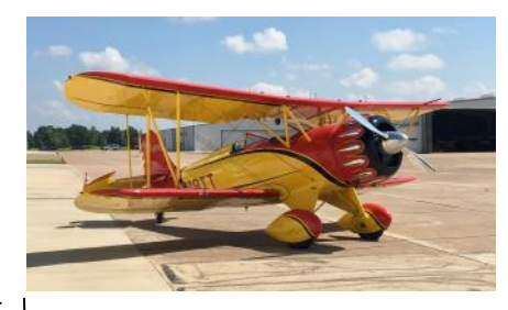
WACO CLASSIC AIRCRAFT New Base at IWS Watch it Fly!

So keep those flight smooth and calm for your passengers no need to scare them away from flying by being silly or careless.