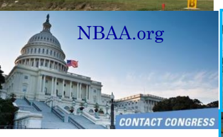
Say No to ATC Privatization, Yes to Fair and Equal Access